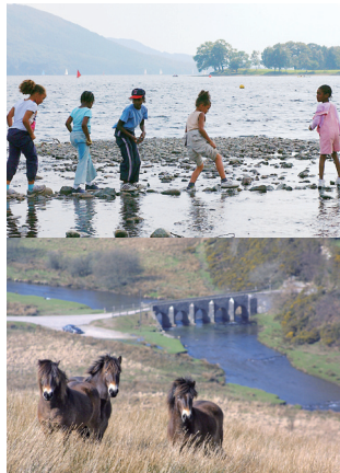
Children paddling Ponies

For further details about where to get your passport stamps and visitor centre opening hours, please go to www.nationalparks.gov.uk/passport