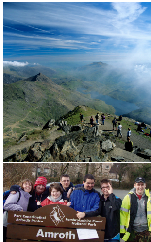
Views from Snowdon summit Out for a walk

For activities to enjoy in National Parks, visit www.nationalparks.gov.uk/visiting/outdooractivities